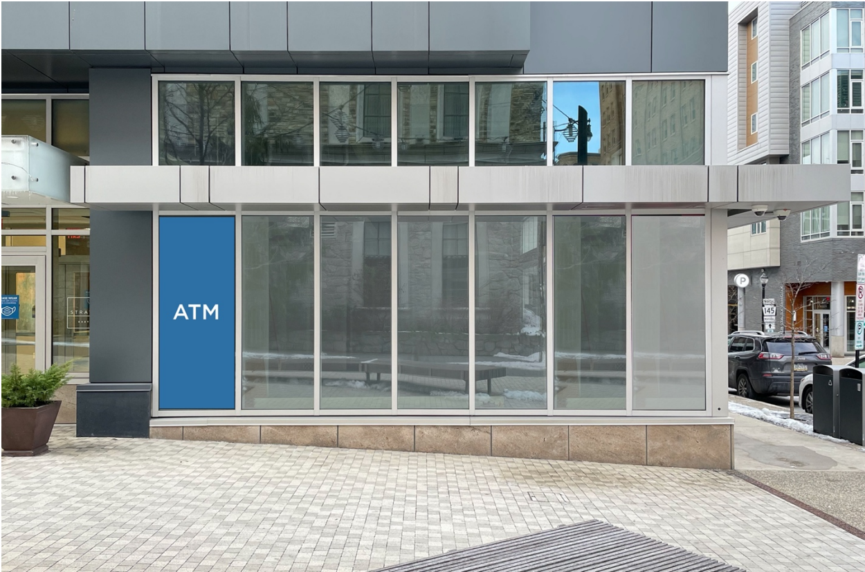
Image of Windows